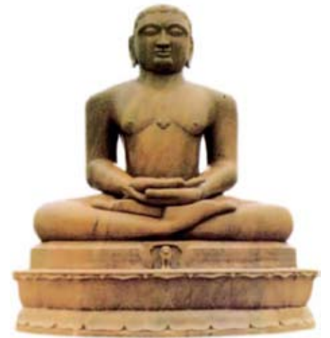
DARKNESS TO LIGHT